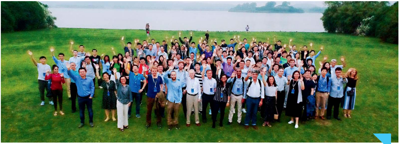
Figure 1. A group picture, taken by a drone, of the participants of the IWMO-2019 meeting in Wuxi, China. In the background is Lake Taihu, one of the largest freshwater lakes in China, which includes some 90 islands and various tourist attractions.