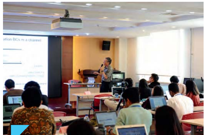
Figure 2. Tal Ezer teaches air-sea interaction and ocean modeling at the 2019's UNESCO/IOC training course in Qingdao, China.

From Wuxi, I traveled for 6.5 hours on the high-speed train to Qingdao to teach at the summer course on climate dynamics and air-sea interaction. The Ocean Dynamics and Climate (ODC) center for regional training and research was established by the Intergovernmental Oceanographic Commission (IOC) of UNESCO and managed by the First Institute of Oceanography (FIO) of the State Oceanic Administration of China. Since 2011, ODC has provided annual training and education courses for selected young scientists, many of them from developing countries. Several leading international experts are invited to teach each year during the 2-week course, focusing on different topics such as regional ocean models, climate change, coupled ocean-atmosphere models, etc. This year's course focused on modeling air-sea interactions, at which my lectures (Fig. 2) included presentations of my research on simulations of tropical storms and hurricanes, as well as practical training with simple model codes that students ran on their own computers. Each day, trainees from different countries (including Bangladesh, Brazil, Cameroon, China, Ecuador, Korea, India, Indonesia, Malaysia, Nigeria, Philippines, Thailand, and Pakistan) learned how to work collaboratively on different projects, wrote reports on what they learned, and gave